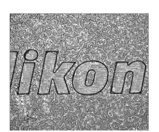
0.5X-digital camera cover logo